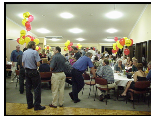
The 10 th Anniversary Dinner in full swing!