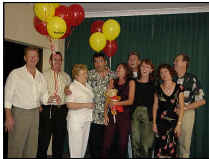
Some of the revellers at the 10 Year Anniversary Dinner