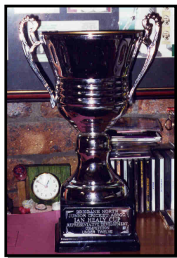
The Ian Healy Cup

Albany Creek is proud to host the U-12 Development Carnival (Ian Healy Cup) for BNJCA in January of each year.