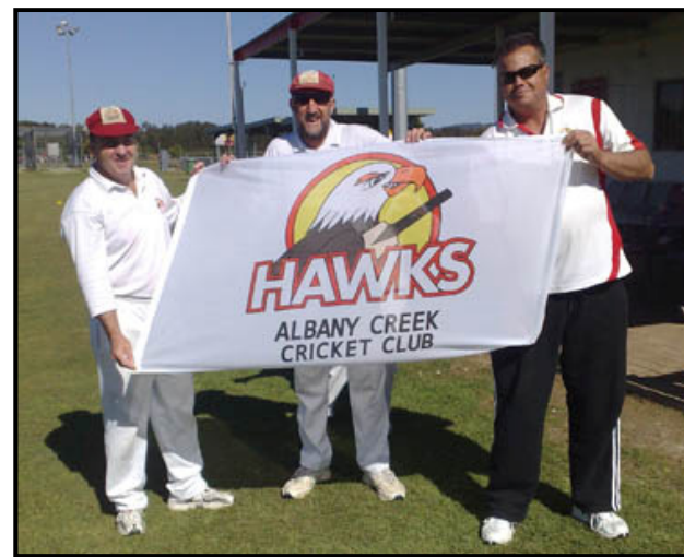
The Hawk's Flag