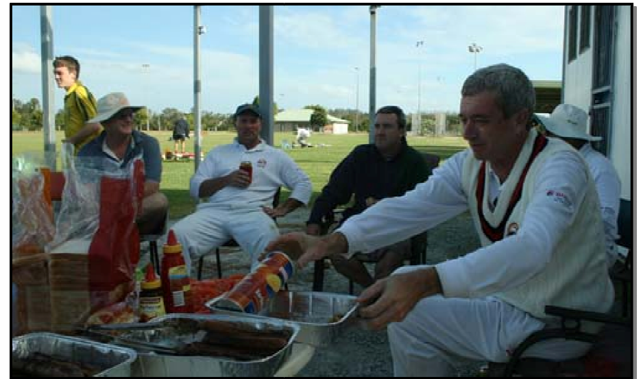
Relaxing after the match'