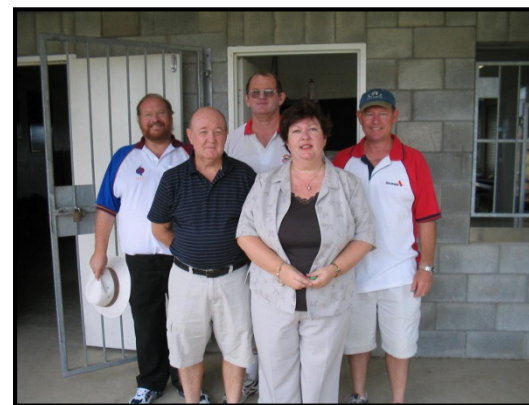
Life Members help out on Trophy Day!